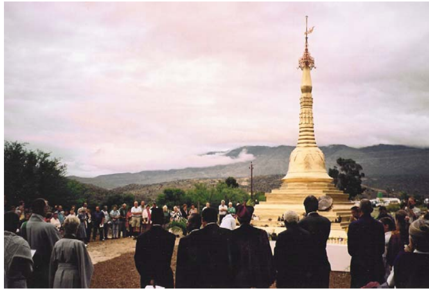
Opening Ceremony: 29th International Peace Pagoda Project Barrydale, South Africa, 2000